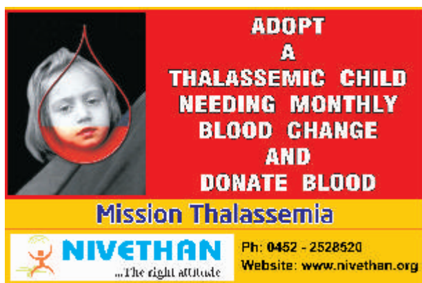
(an awareness creation poster by Nivethan)